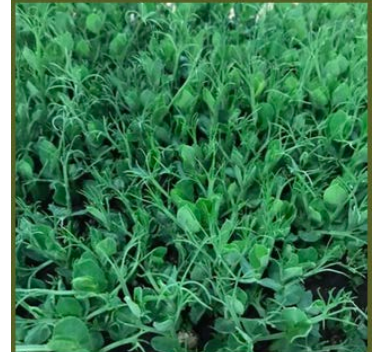
Sebastopol Microgreens #10826

#10779 Living Basil #11299 Living Thai Basil #14941 Living Chervil #11226 Living Cilantro #10843 Living Citrus Lace