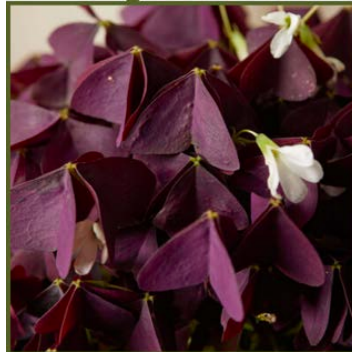
Sebastopol Microgreens #13648