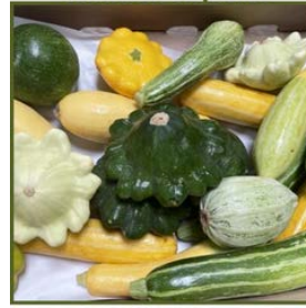
Comanche Creek Farms #3343, 10 lb. $26.00