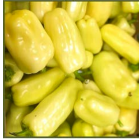
County Line Harvest #2343, 10 lb. $33.50