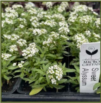
Sebastopol Microgreens #13472