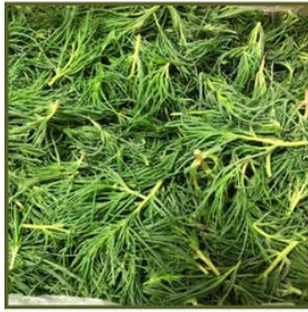
County Line Harvest #13678, 1 lb. $18.50