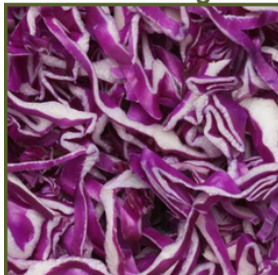
Shredded Red Cabbage