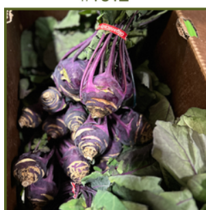
Org Purple Kohlrabi #1612