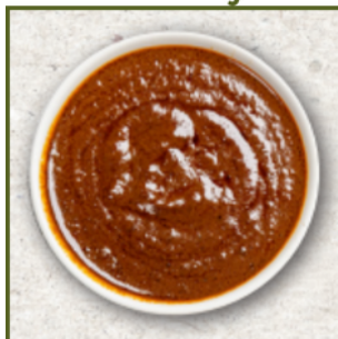
Savor Imports #15277