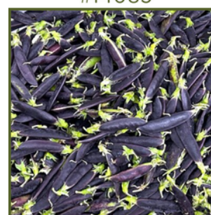
Org Purple Snap Peas #14085