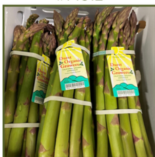
Organic Asparagus #14512