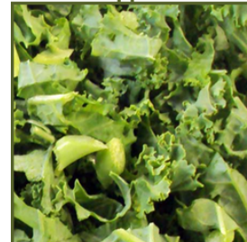
1" Chopped Kale