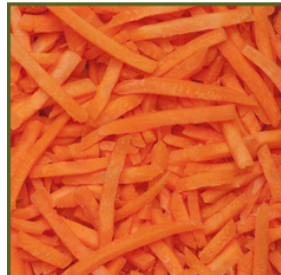
Shredded Matchstick Carrots