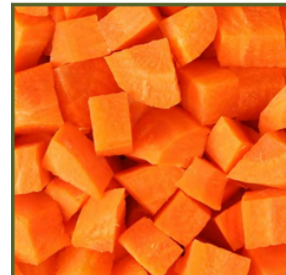
¼" Diced Carrots