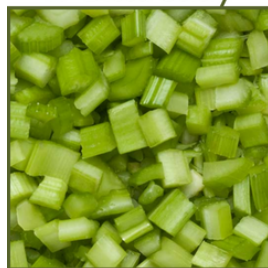
¼" Diced Celery