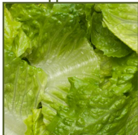
1" Chopped Romaine