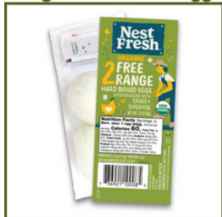
Nest Fresh #15301